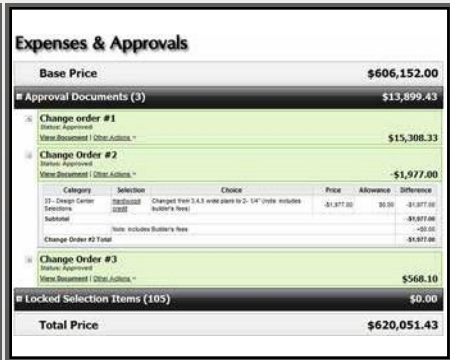
▲ Up-to-date Financial Total Check a running total, in real-time, of the financial decisions you have made on your new home.